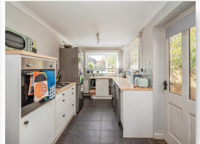
Yaxleys Lane, Aylsham, Norwich, NR11 6DX