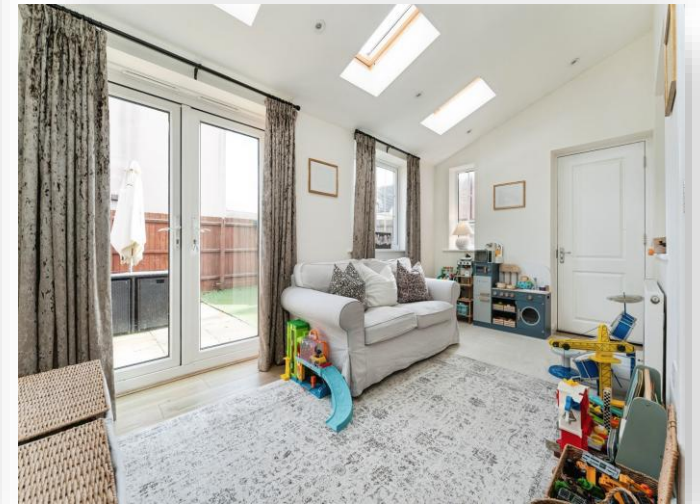
Guernsey Way, Littleport CB6 1GD