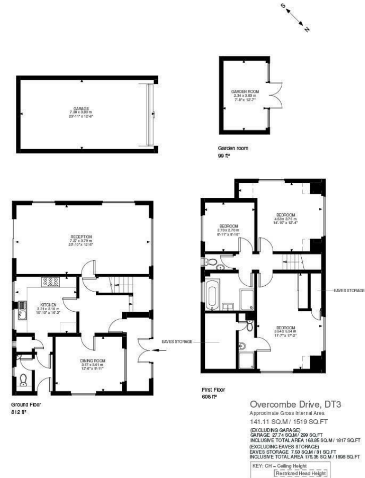
Illustration for identification purposes only. Not to scale. Floor Plan Drawn According To RICS Guide lines.