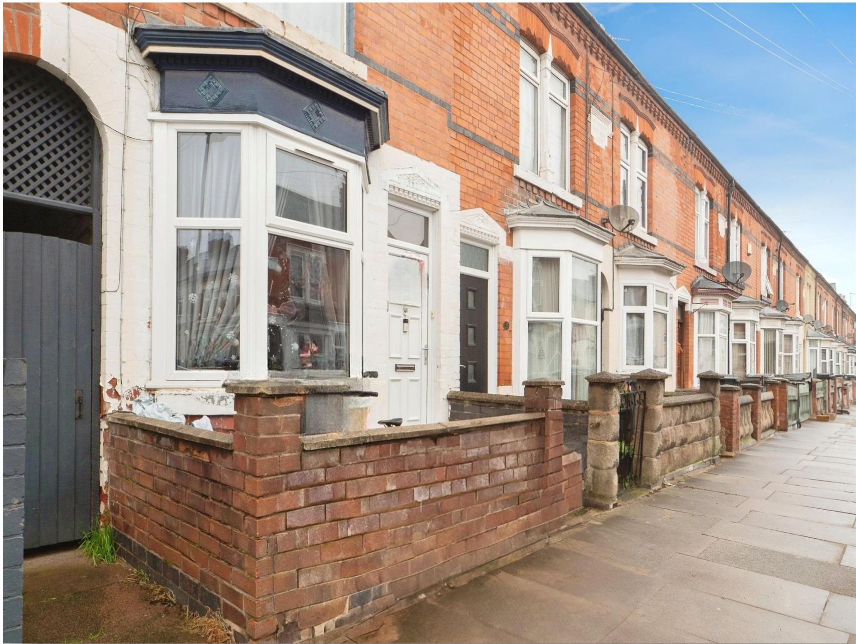
Sylvan Street, Leicester LE3 9GU