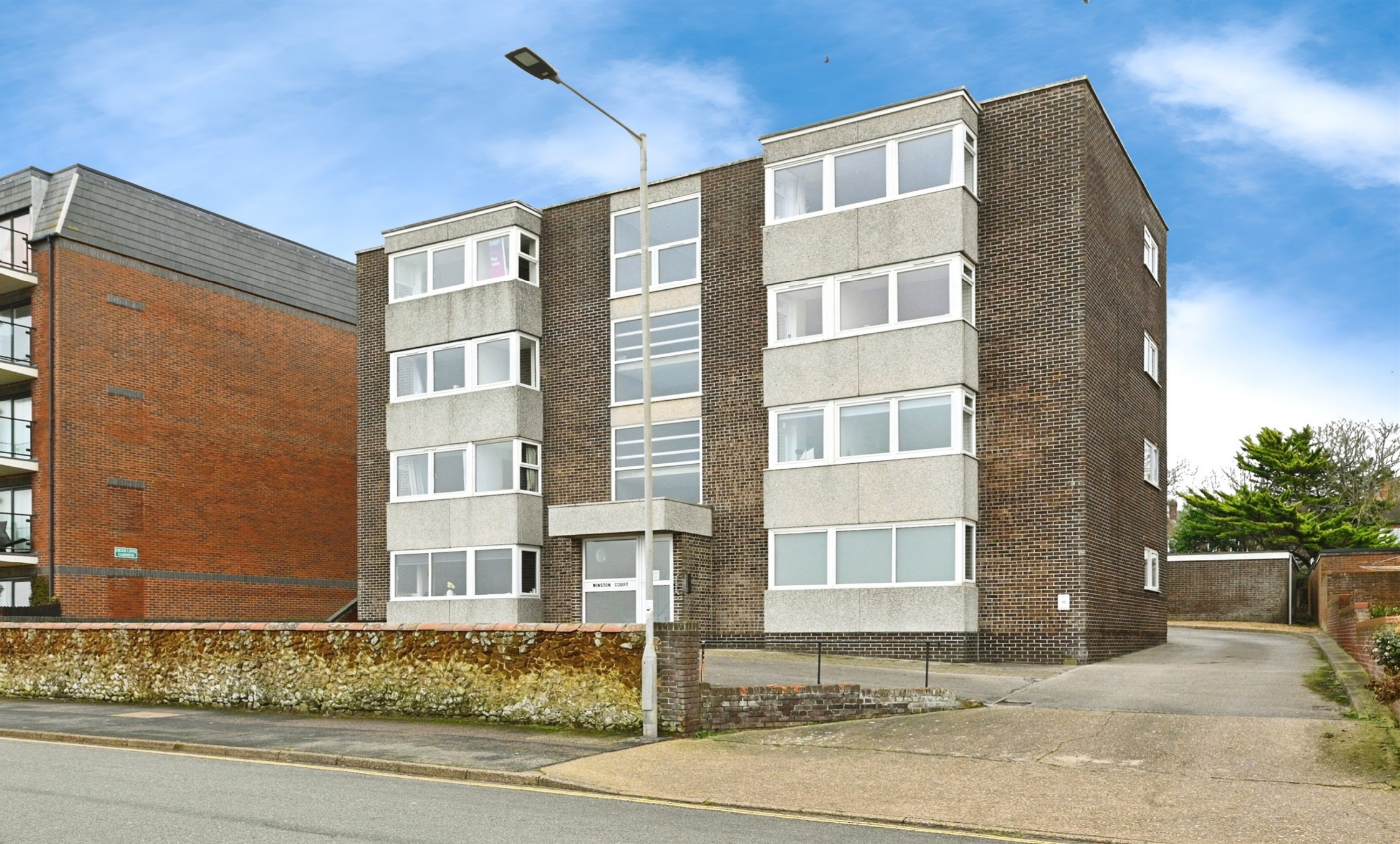
Winston Court, Cliff Parade, Hunstanton, PE36 6DJ