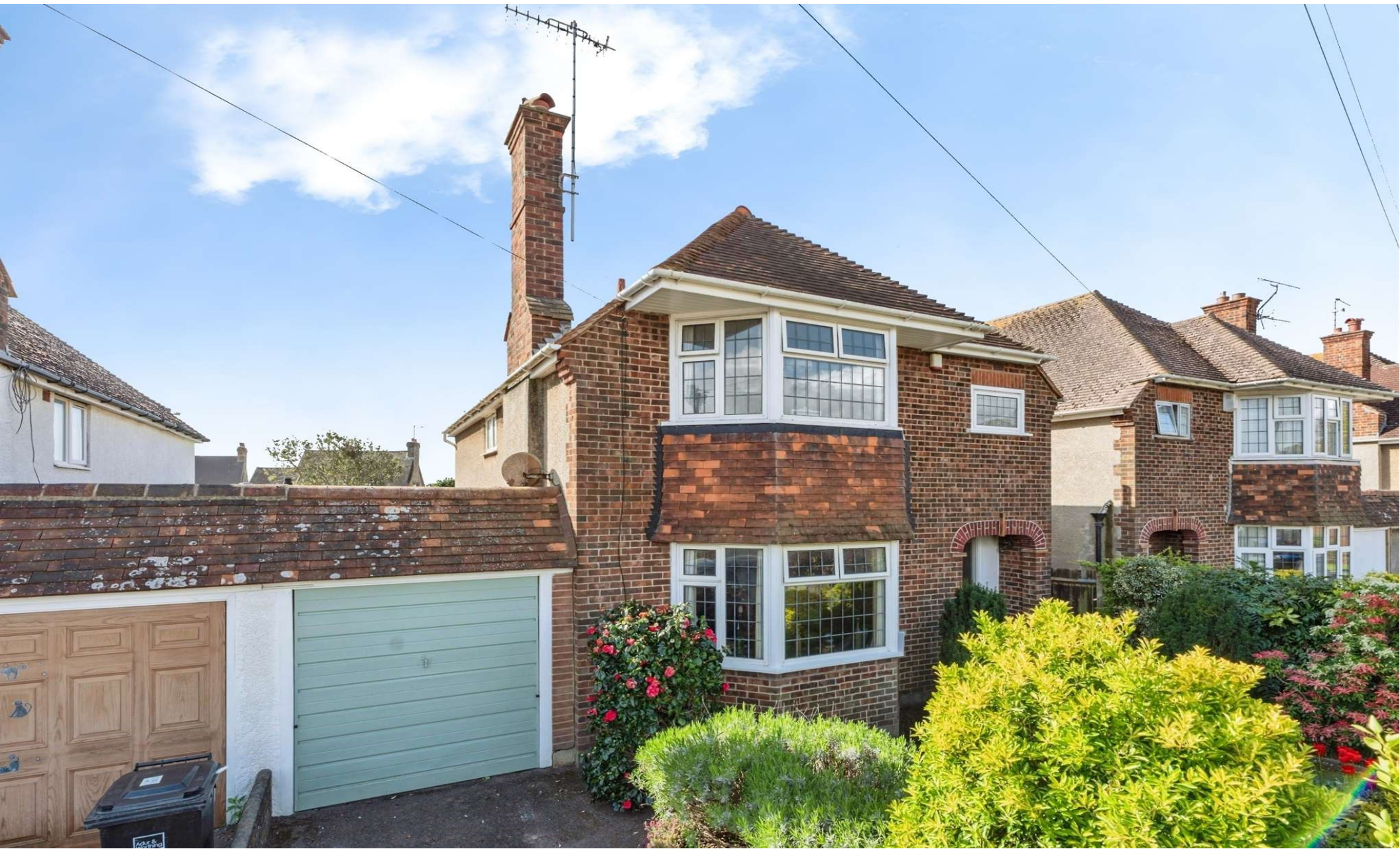
Harvey Road, Goring-By-Sea Worthing BN12 4DS