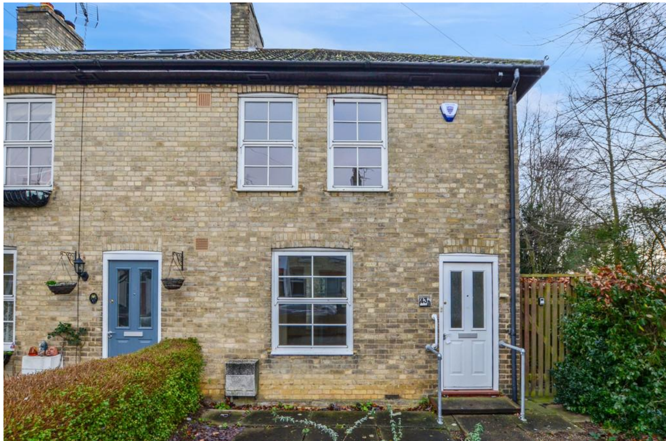
Hobart Road, Cambridge