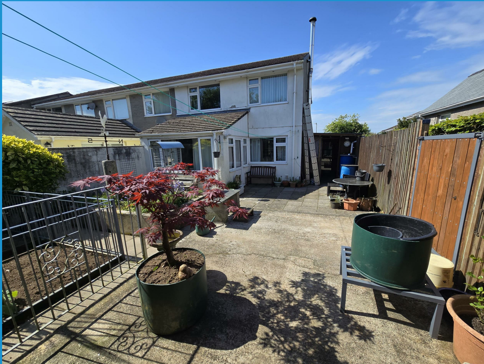
26 Tor View Tregadillett | Launceston