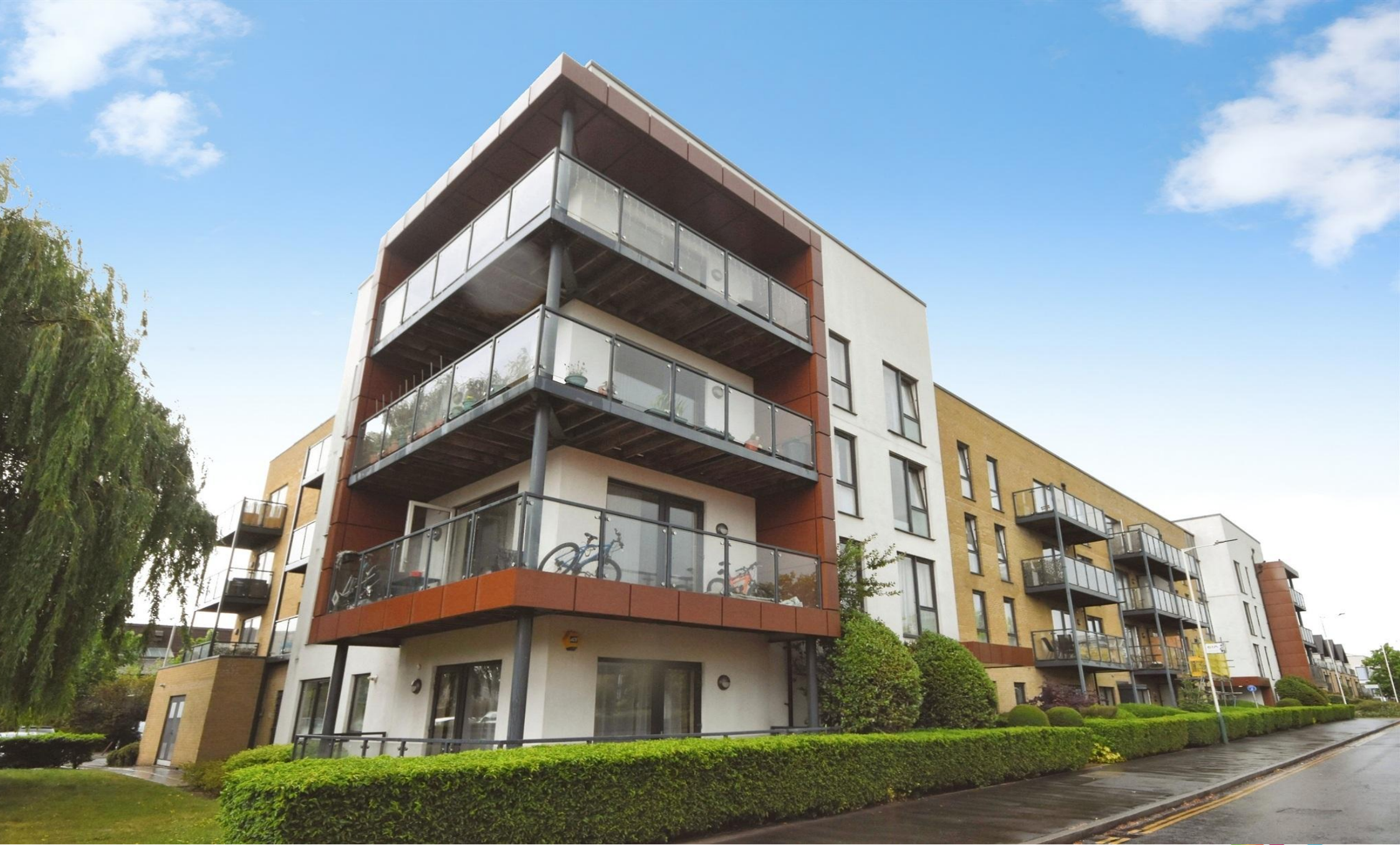
Blackthorn House, St. Clements Avenue, Romford, RM3 0JE