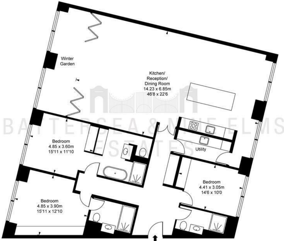
ILLUSTRATION FOR IDENTIFICATION PURPOSES ONLY ALL MEASUREMENTS AND AREA FIGURES SUPPLIED BY OTHERS. ACCURACY IS NOT GUARANTEED. THIS PLAN MUST NOT BE REPRODUCED BY ANY OTHER PERSON WITHOUT PERMISSION

These particulars, whilst believed to be accurate are set out as a general outline only for guidance and do not constitute any part of an offer or contract. Intending purchasers should not rely on them as statements of representation of fact, but must satisfy themselves by inspection or otherwise as to their accuracy. No person in this firm's employment has the authority to make or give any representation or warranty in respect of the property.