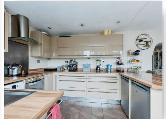
Walnut Grove, Glen Parva Leicester LE2 9HT