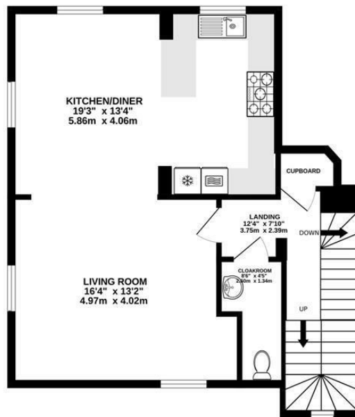
1ST FLOOR 610 sq.ft. (56.7 sq.m.) approx.