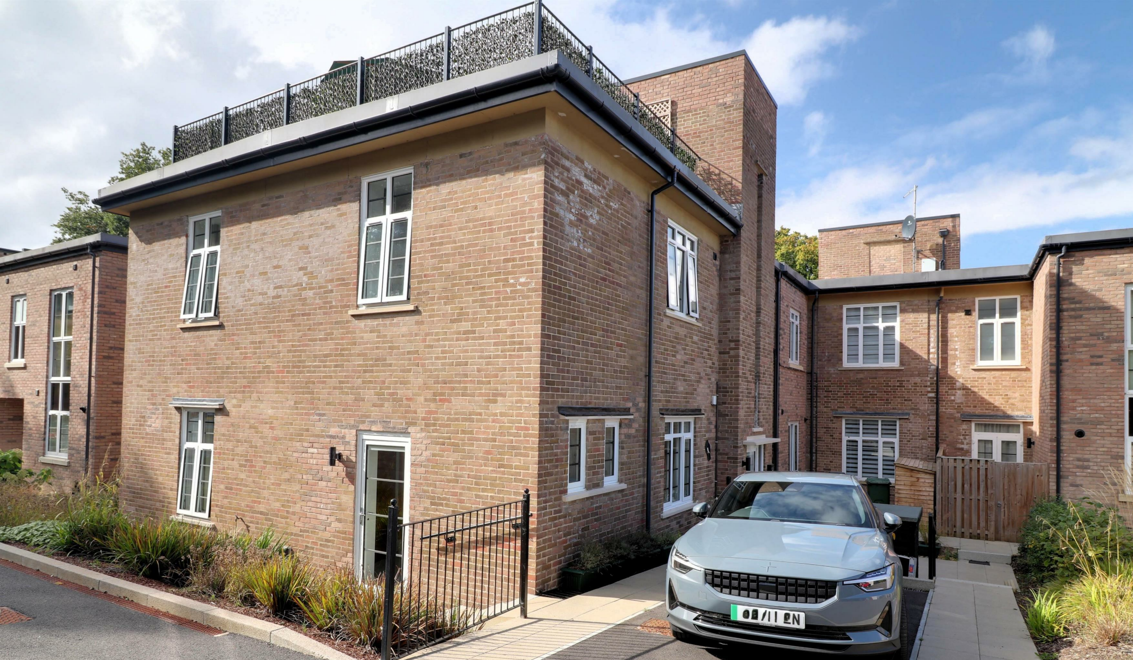
John Martin Gardens, Standish GL10 3WB £538,000