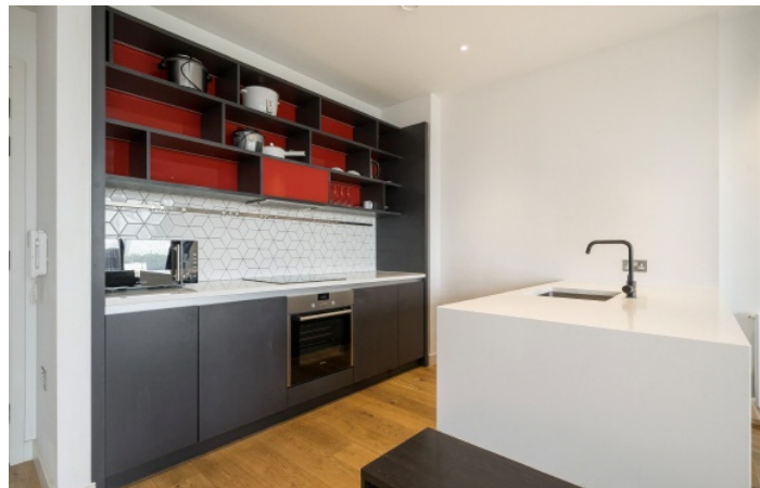
Lyell Street, E14