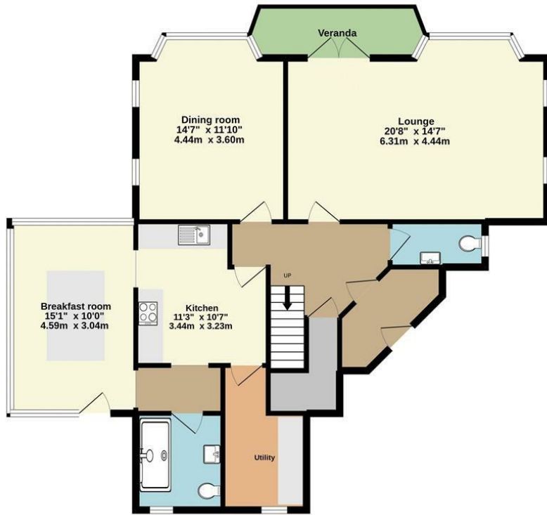
Ground Floor 1045 sq.ft. (97.0 sq.m.) approx.