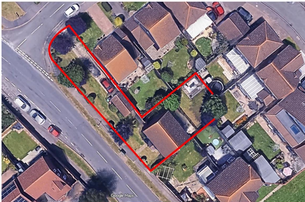
Imagery ©2020 Google, Imagery ©2020 Airbus, Map data ©2020 5 m