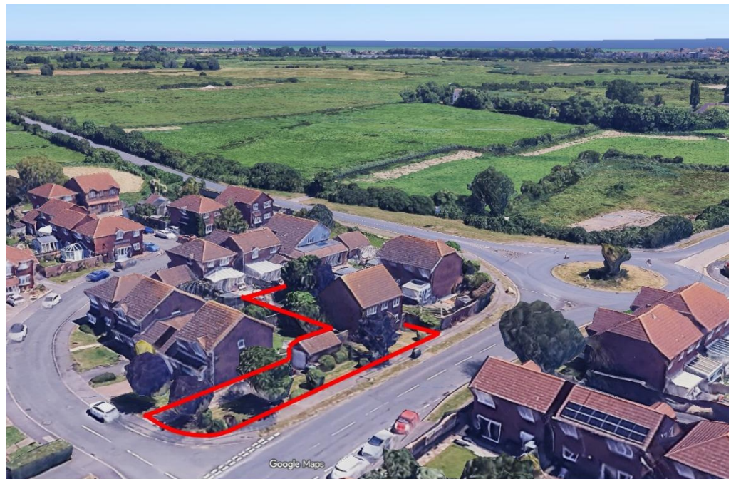
Imagery ©2020 Data SIO, NOAA, U.S. Navy, NSA, GEBCO, Google, Vexcel, Imagery ©2020 Airbus, Landstar / Copernicus, Imagery ©2020 Airbus, Map data ©2020 10 m