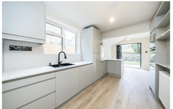
Lynton Road, SE1