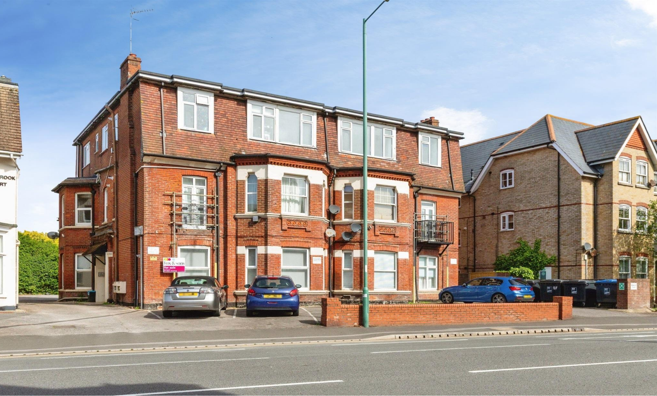
Brooklyn Court Christchurch Road, Bournemouth BH1 4BD