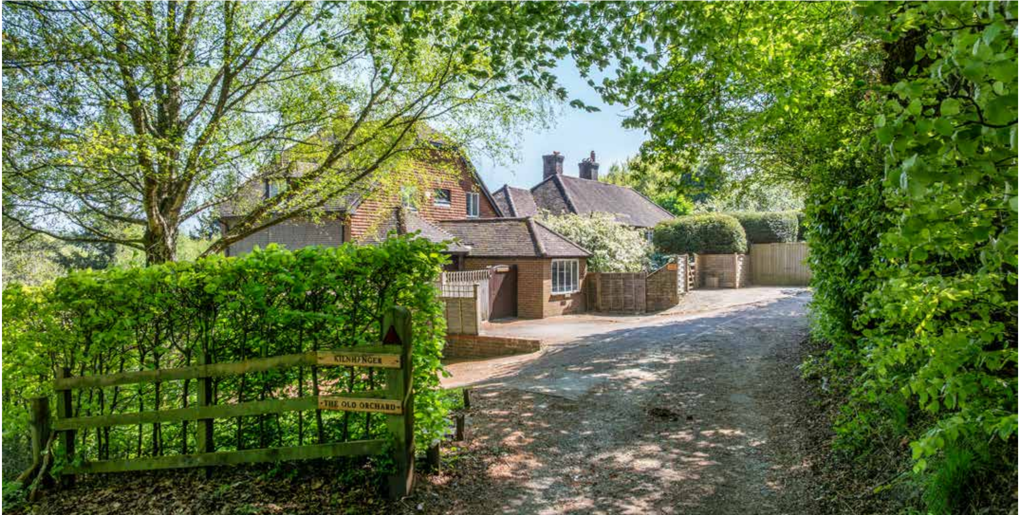
KILNHANGER, MARLEY HEIGHTS, HASLEMERE