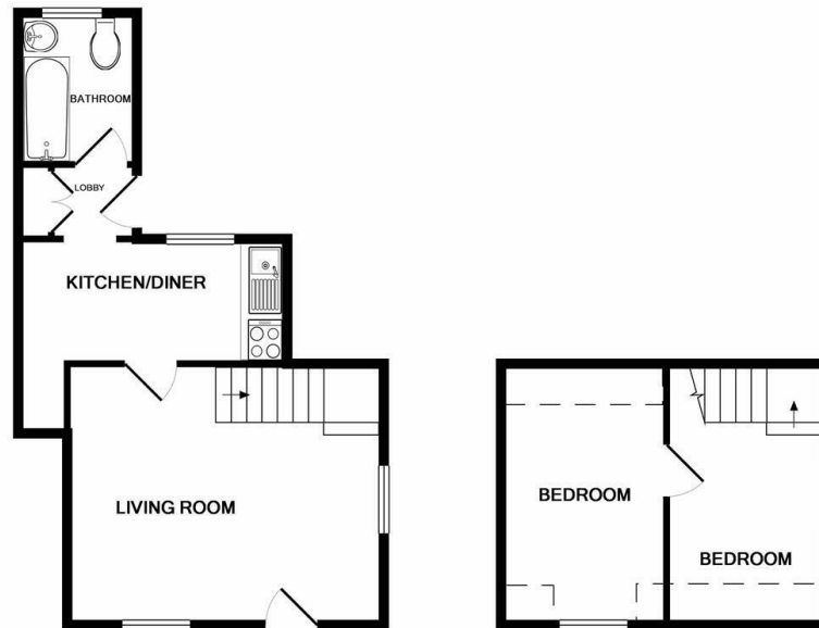
GROUND FLOOR APPROX. FLOOR AREA 30.8 SQ.M. (332 SQ.FT.)