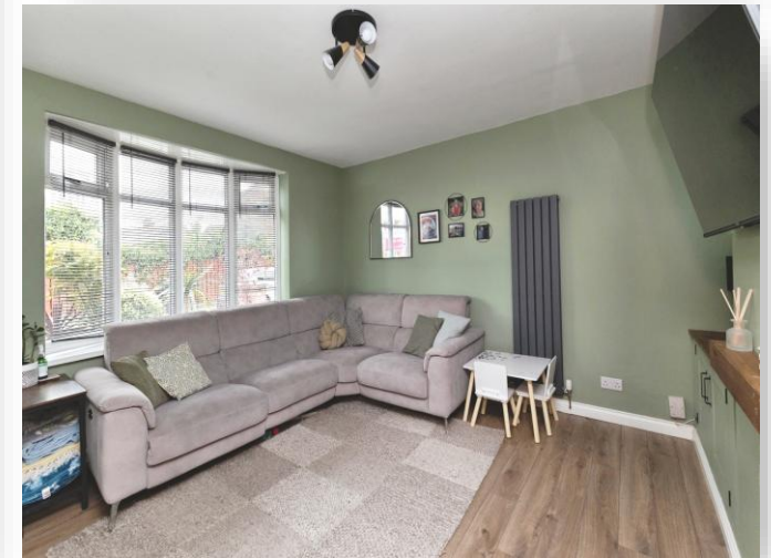
Harrogate Crescent, Middlesbrough TS5 6PS