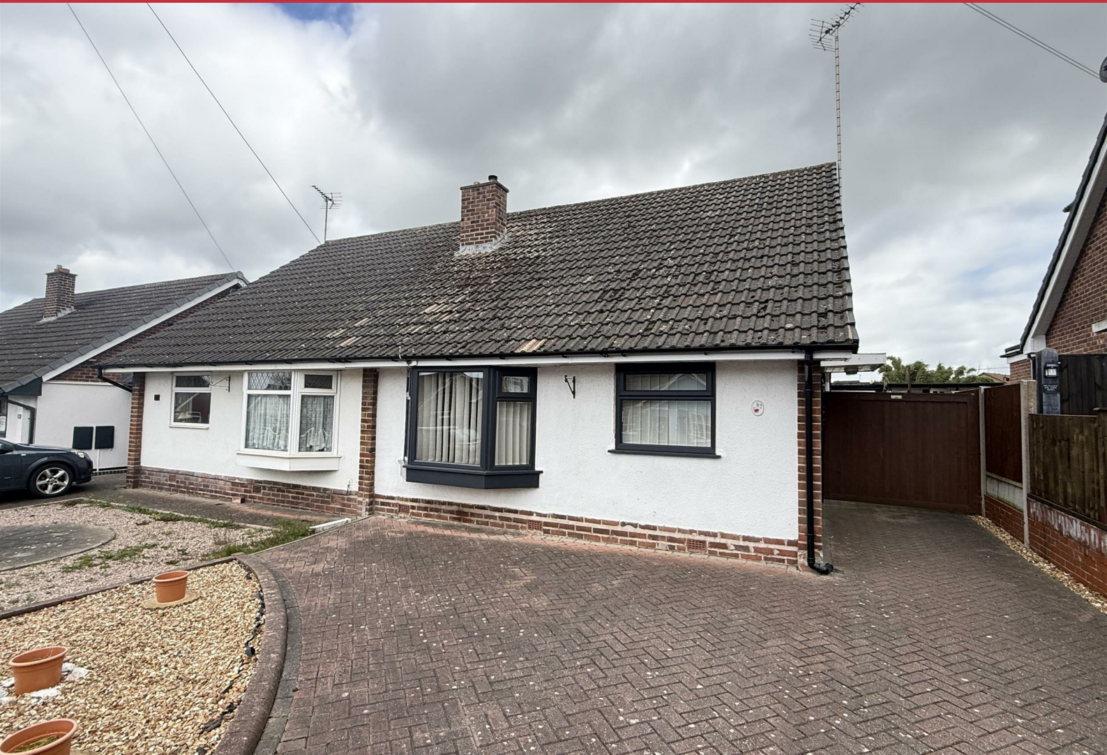
** Semi Detached Bungalow ** Two Bedrooms ** Driveway & Garage **

A well-presented semi-detached bungalow occupying a popular residential location in Stapenhill, this attractive home is set back from the road with a front driveway providing off-road parking.