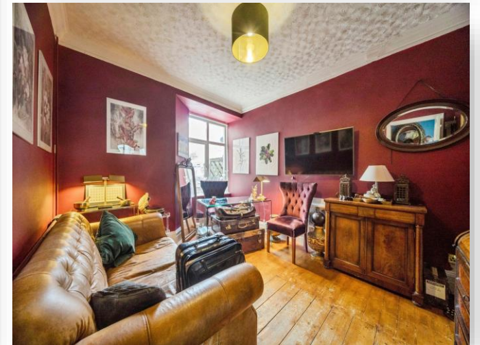
Green Lane, Kettering NN16 0DA