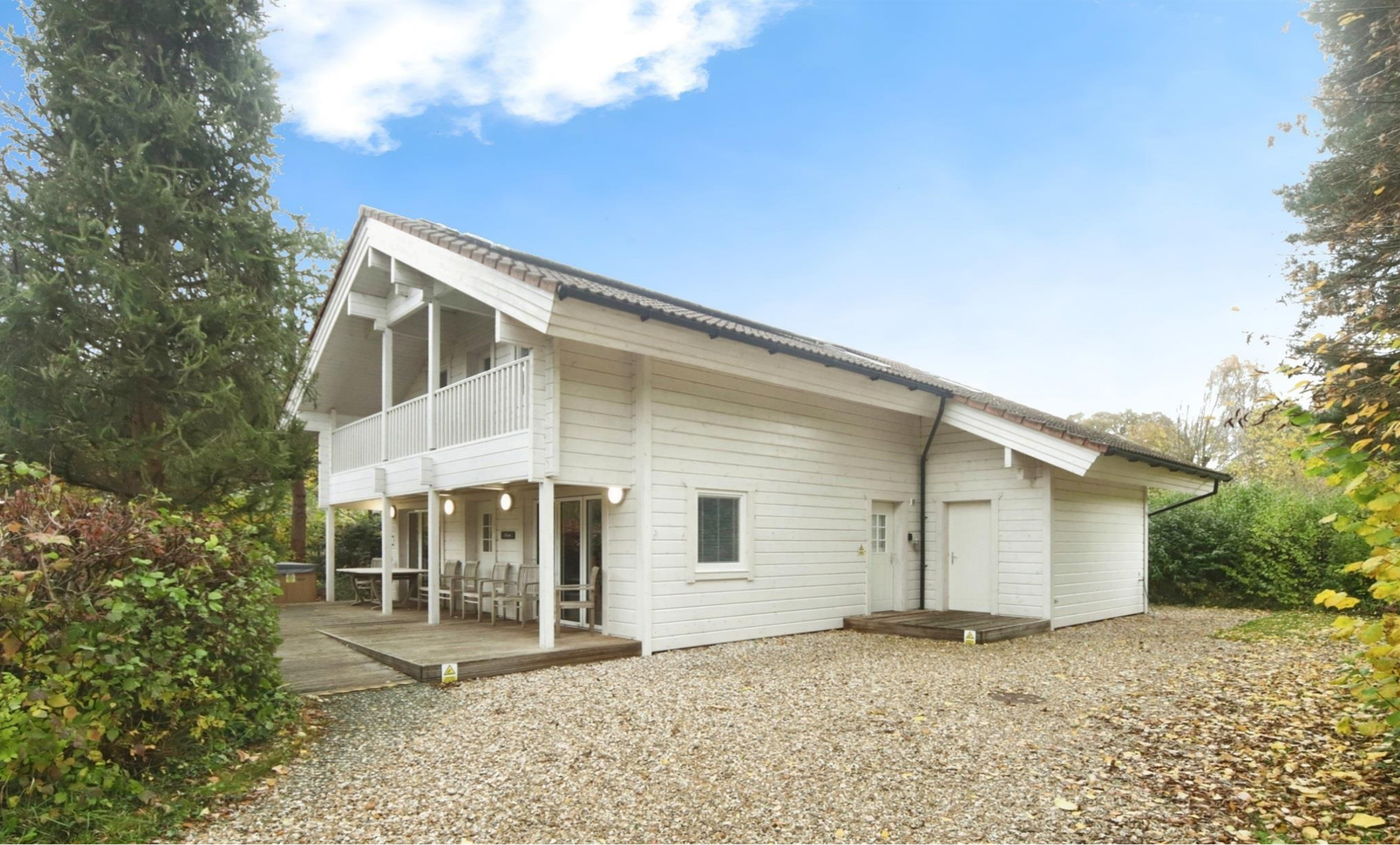
Heron Lodge Parsonage Lane, Kingston St. Mary Taunton TA2 8HL