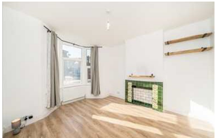
Elswick Road, SE13