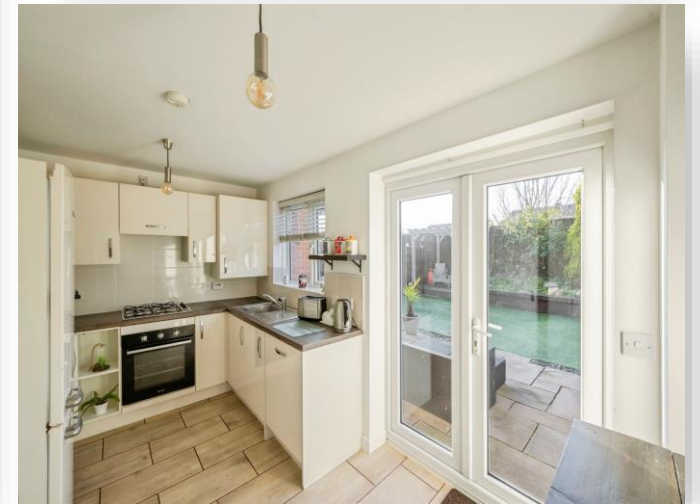
Prior Way, Bolton-Upon-Dearne Rotherham S63 8FA