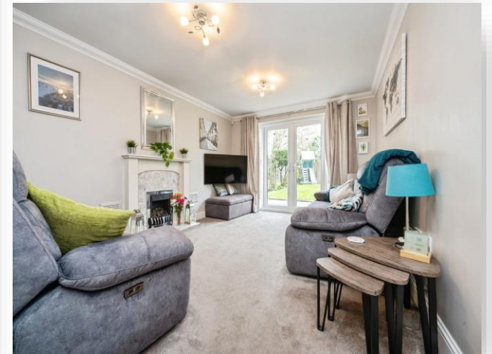
Garland Way, Leighton Buzzard, LU7 4NY