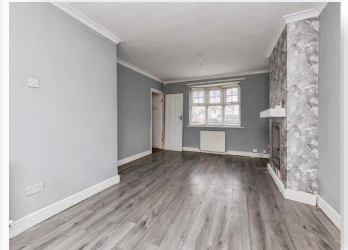
Catcote Road, Hartlepool, TS25 4RD