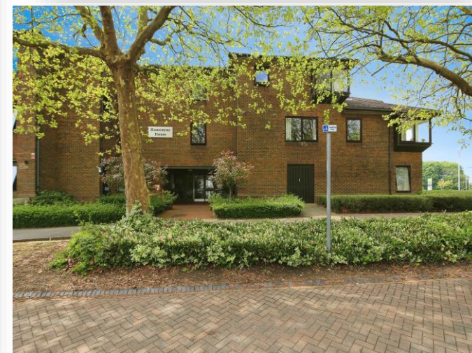
Homenene House, Orton Goldhay Peterborough PE2 5PP