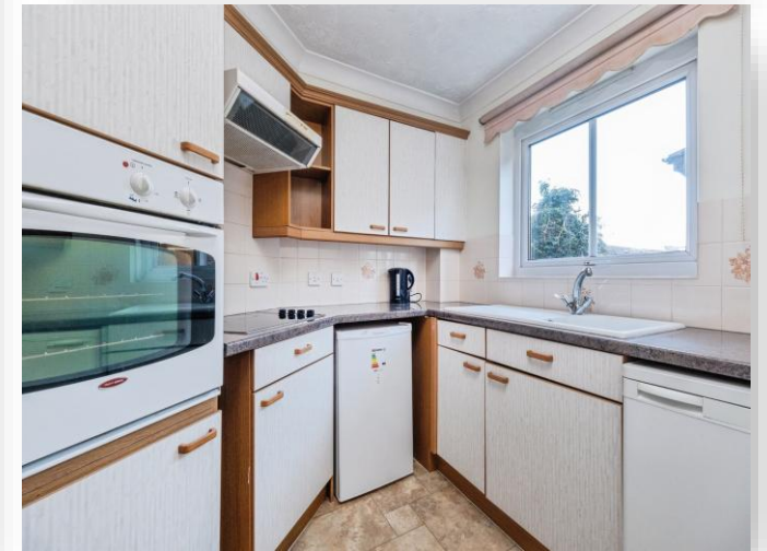
Hamilton Court, Lammas Walk, Leighton Buzzard, LU7 1JF