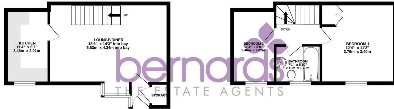
1ST FLOOR 304 sq.ft. (28.2 sq.m.) approx.

TOTAL FLOOR AREA: 636 sq.ft. (59.1 sq.m.) approx.