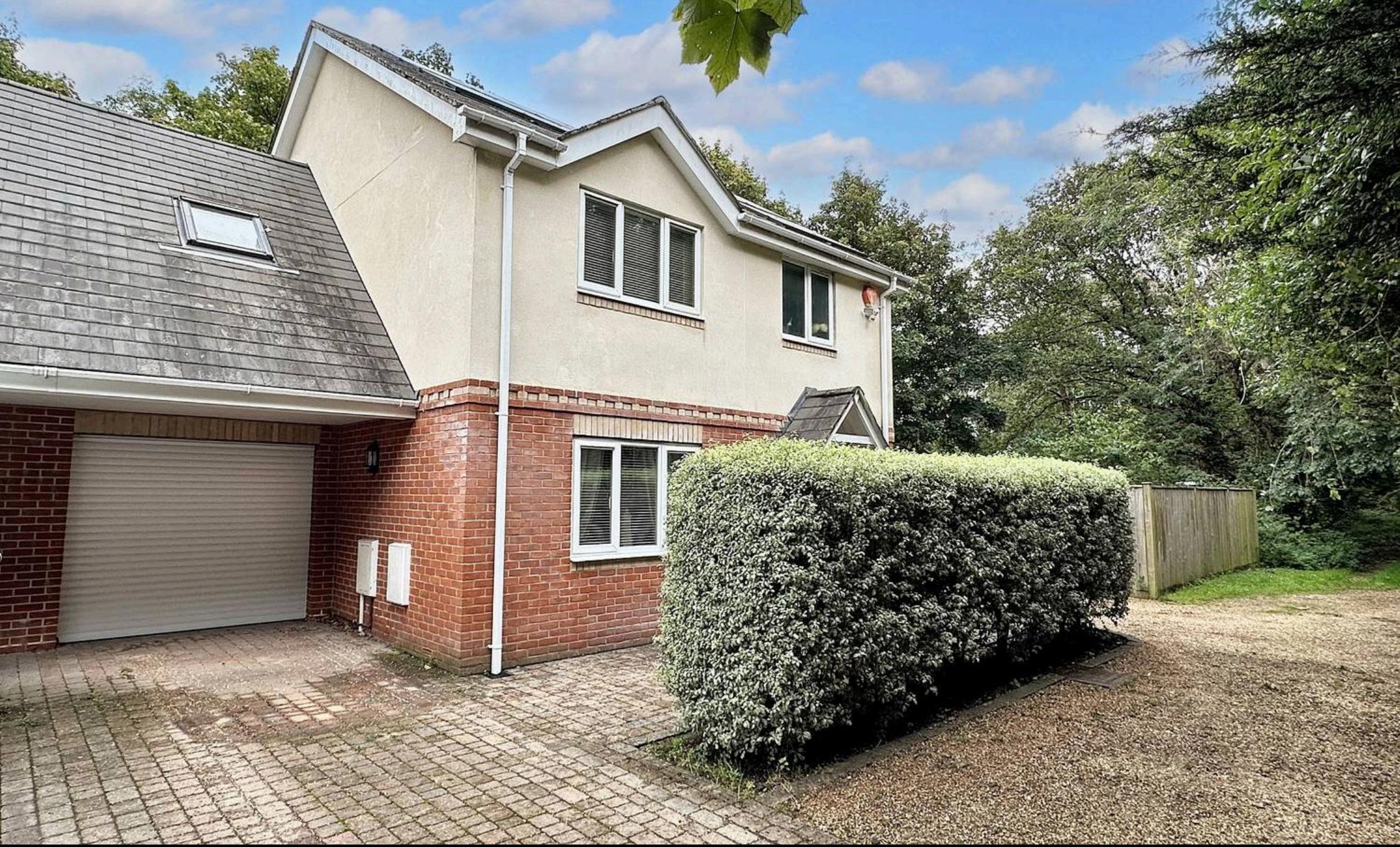
Augustus Cottage Roman Road, Hythe, SO45 3NN £475,000