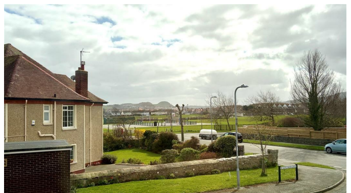
VIEW FROM DINING AREA

Upvc double glazed window, double radiator. Opening through to:-