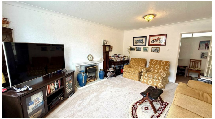
VIEW FROM LOUNGE

Fire surround, t.v point, coved ceiling, upvc double glazed window with deep display sill, views to the lower slopes of the Great Orme, double radiator.