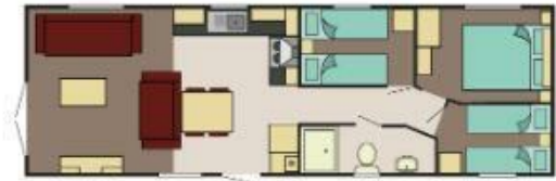
Saffron Deluxe 37x12 3 Bed