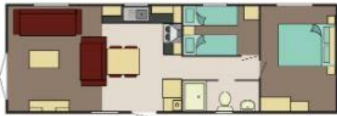
Saffron Deluxe 36x12 2 Bed