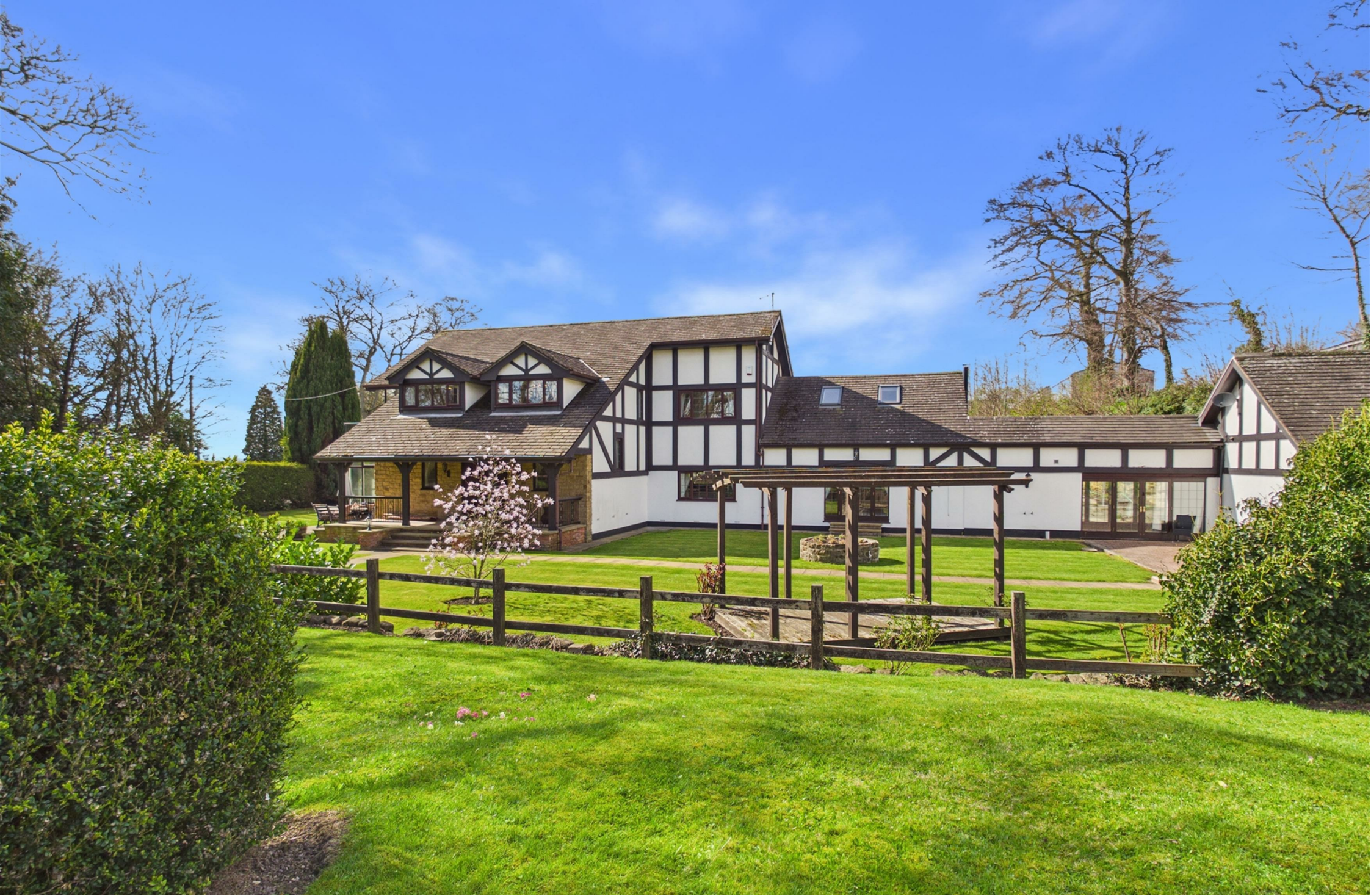
South Lawn Wakefield Road, Pontefract, WF8 4HA