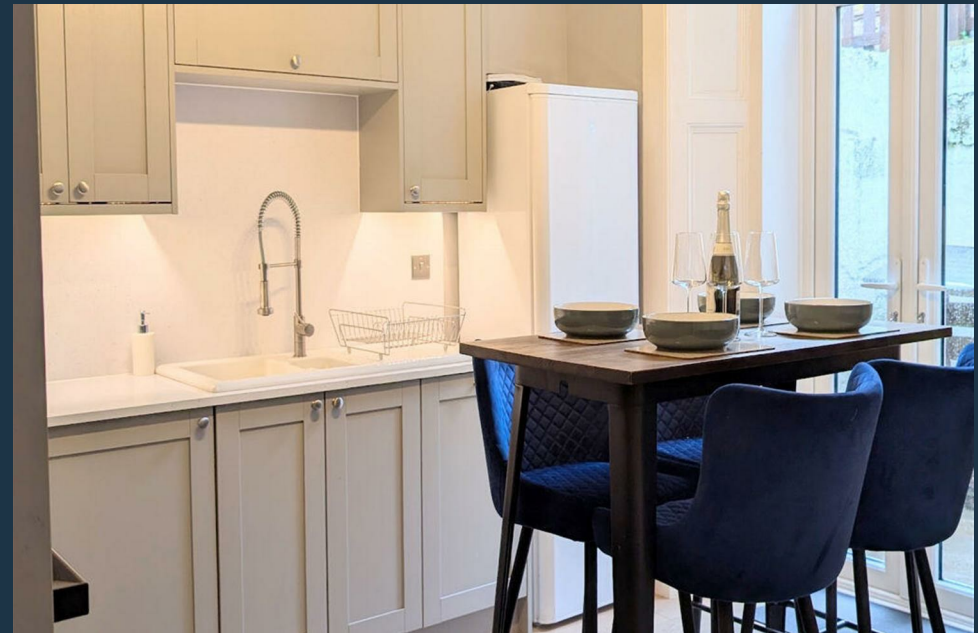
A beautiful family home in immaculate condition