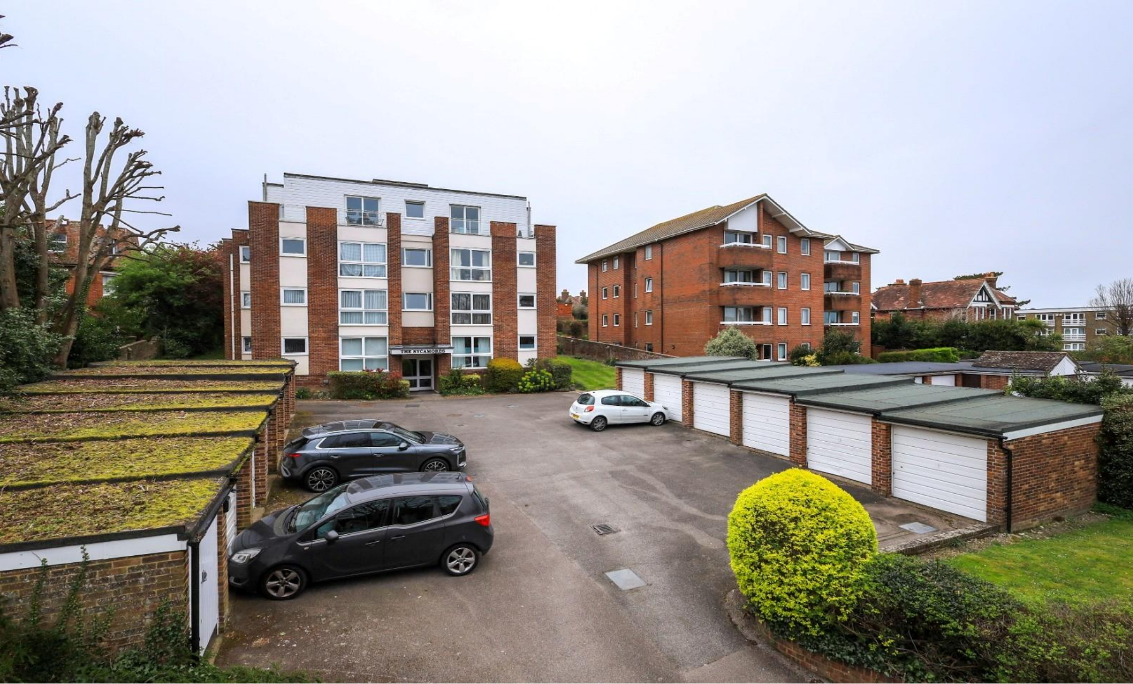
The Sycamores Arundel Road, Eastbourne BN21 2EP