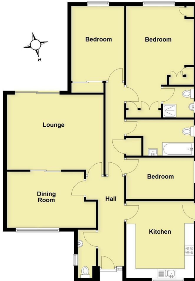
Total area: approx. 116.0 sq. metres (1248.5 sq. feet) This plan is for illustration purposes only and should not be relied upon as a statement of fact