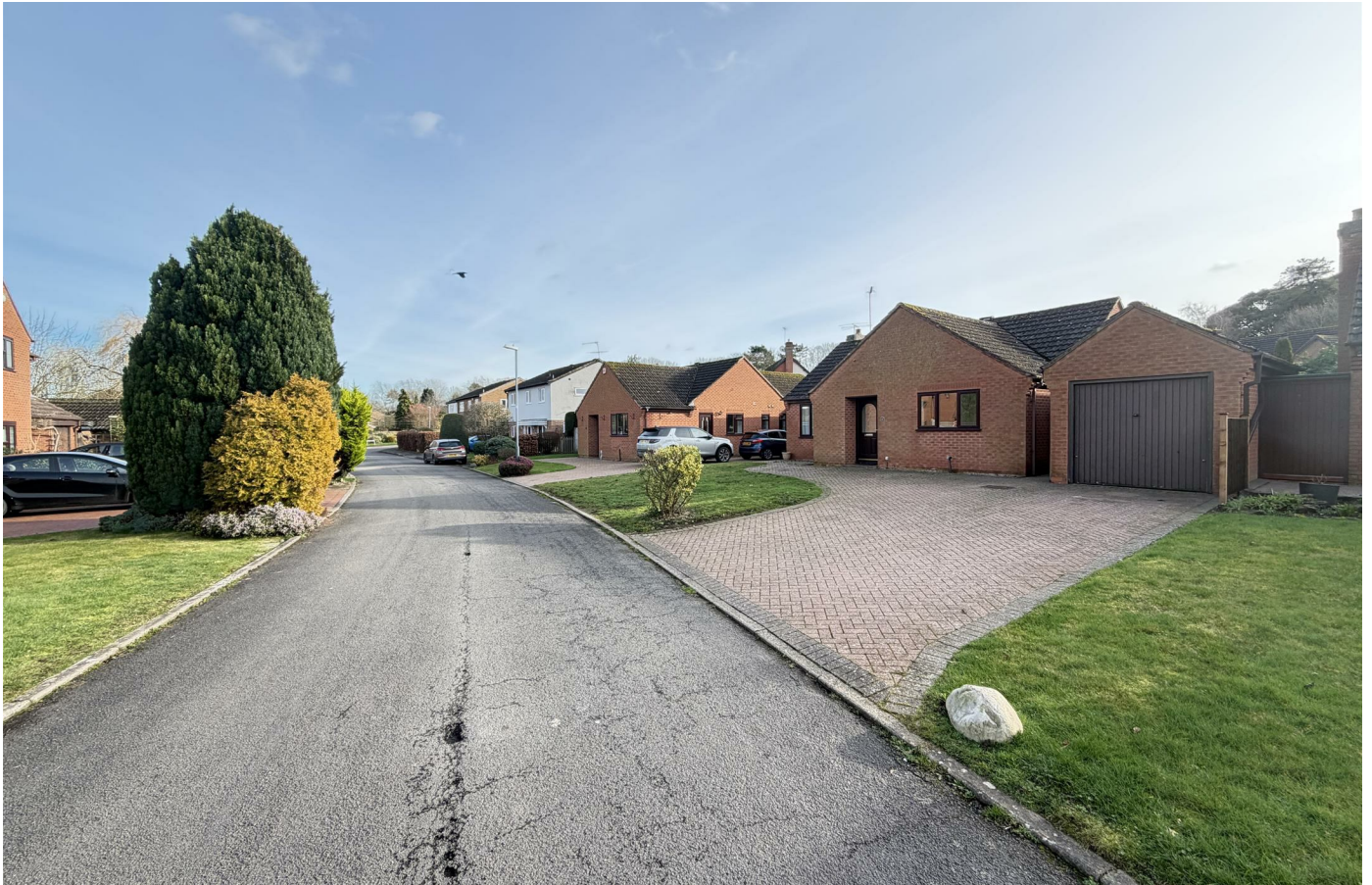
15 Bennett Drive, Warwick, CV34 6QJ