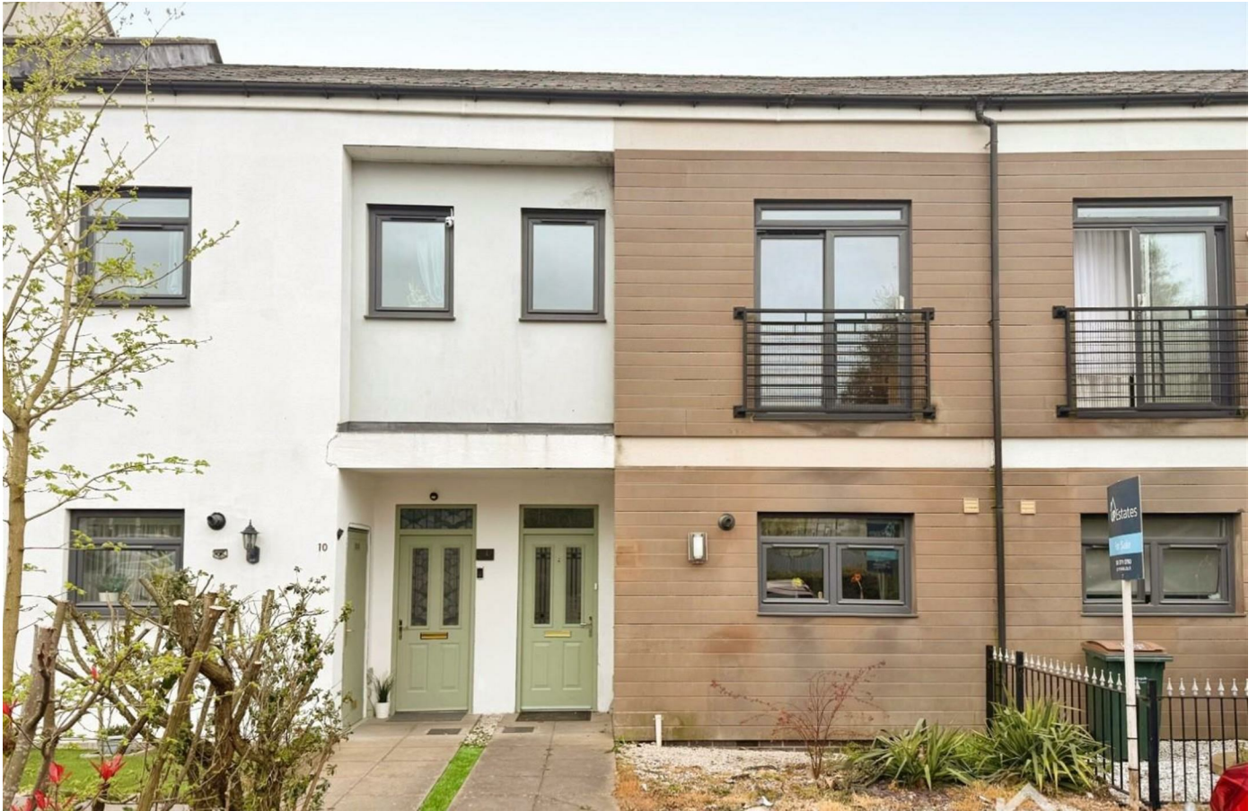
Paladine Way, Coventry