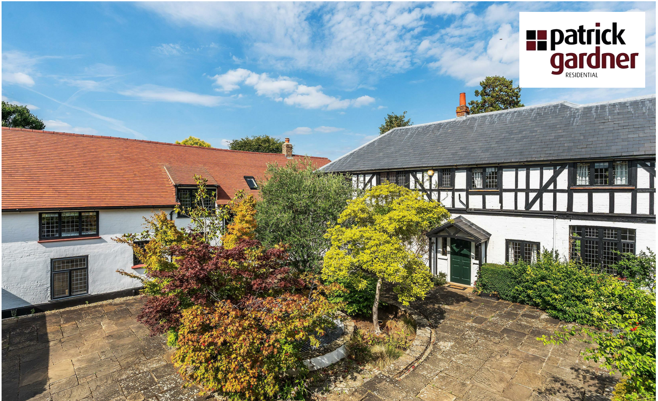
Old Court, 8 The Old Street, Fetcham, Surrey, KT22 9QJ