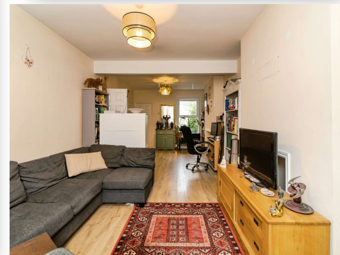
Salisbury Road, Lowestoft NR33 0HE