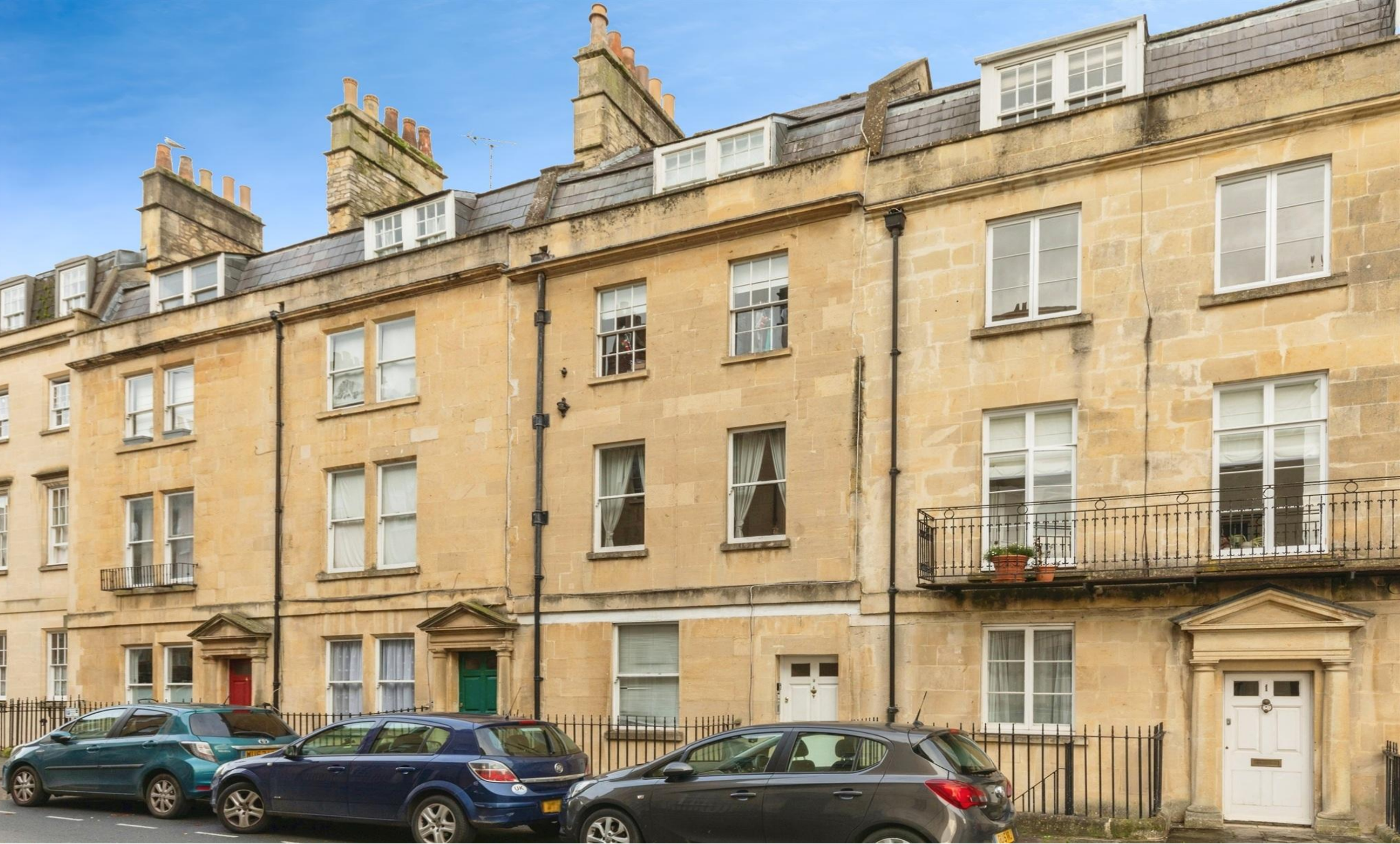
First Floor Flat Great Stanhope Street, Bath BA1 2BQ