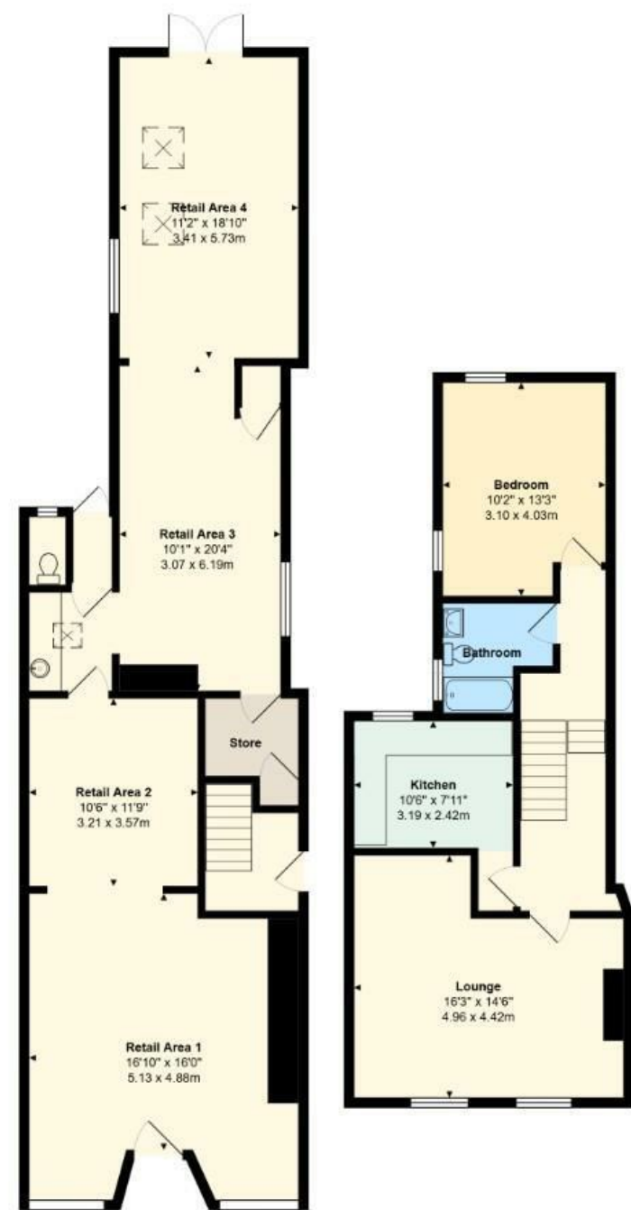
4 Beulah Road, Rhiwbina