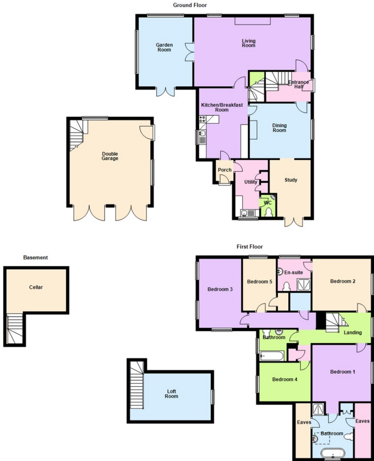
Illustration For Identification Purposes Only. Not To Scale. Plan produced using PlanUp.