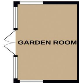
GROUND FLOOR 1139 sq.ft. (105.8 sq.m.) approx.