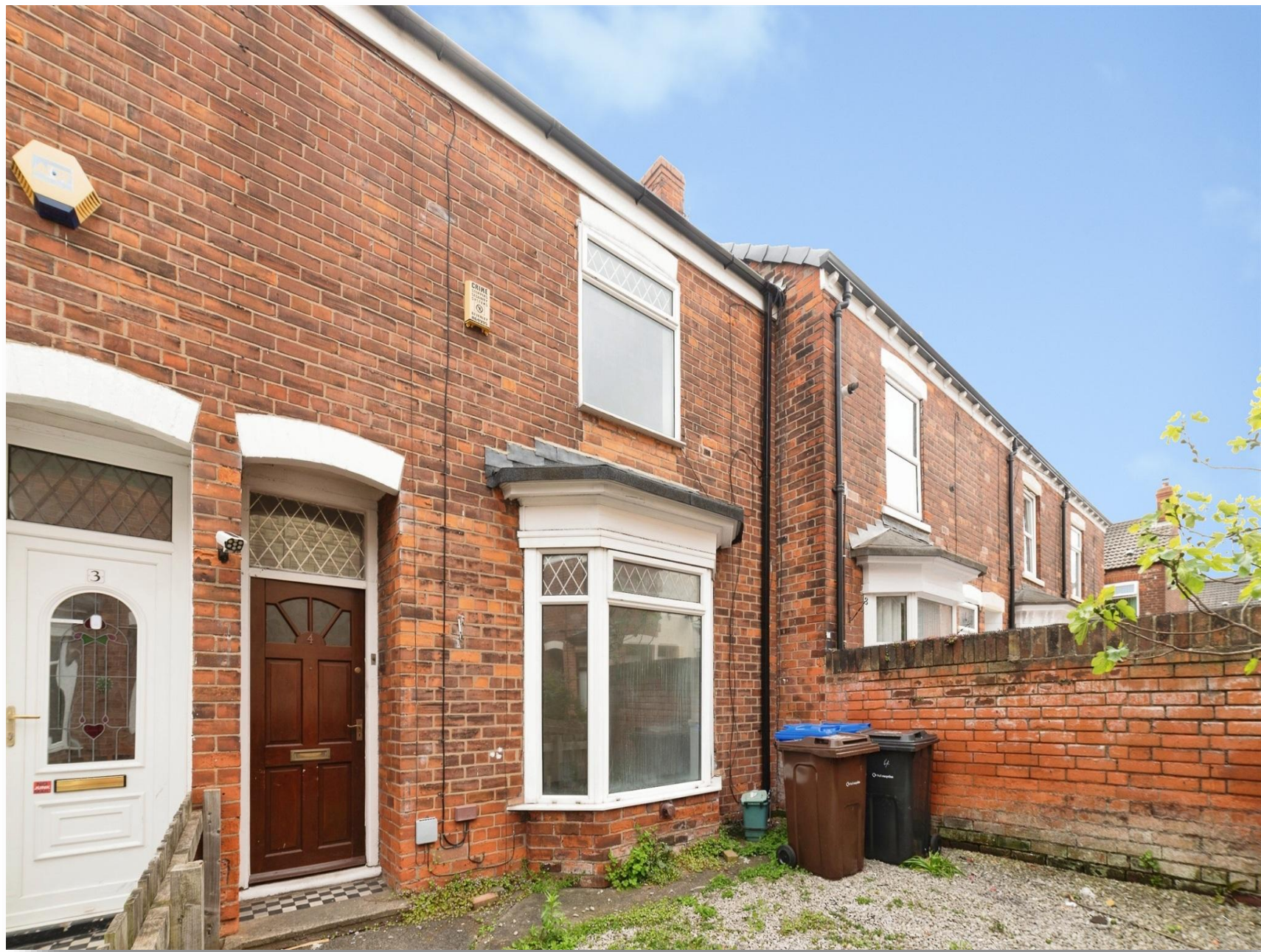
Ivy Villas, Middleburg Street, Hull, HU9 2QT