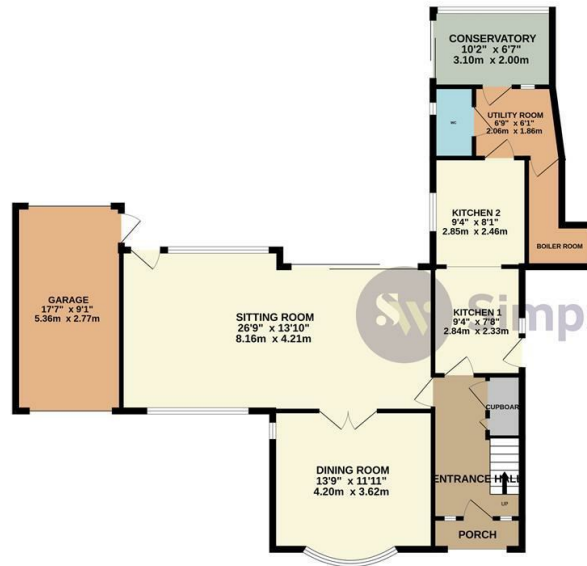
GROUND FLOOR 1111 sq.ft. (103.3 sq.m.) approx.