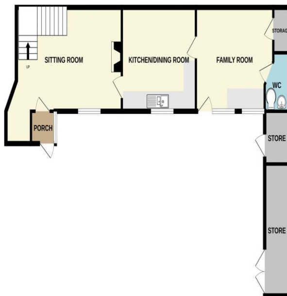
GROUND FLOOR 678 sq.ft. (63.0 sq.m.) approx.