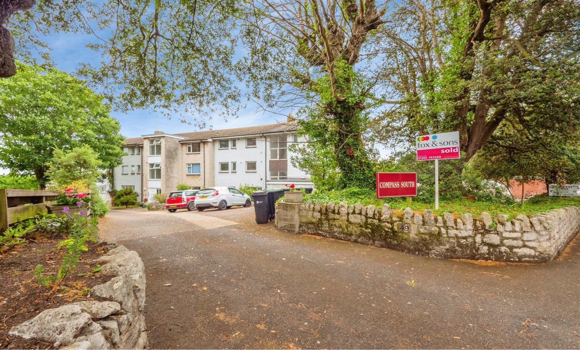
Compass South Rodwell Road, Weymouth DT4 8QT