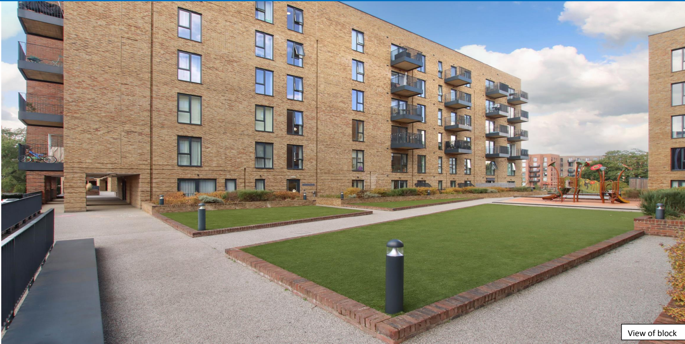
View of block