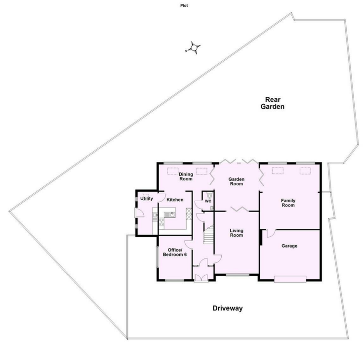
Total area: approx. 294.4 sq. metres (3168.5 sq. feet)